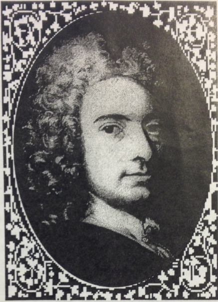
Bishop George Berkeley (1685-1753)