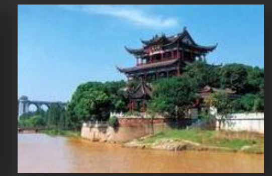
Qingchuan Pavilion 晴川阁