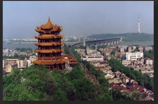
Yellow Crane Towe 黄鹤楼