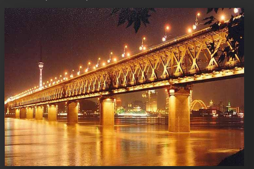
The Yangtze Bridge 长江大桥