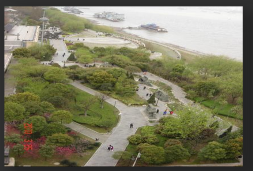
Dayu Fairy Garden 大禹神话园