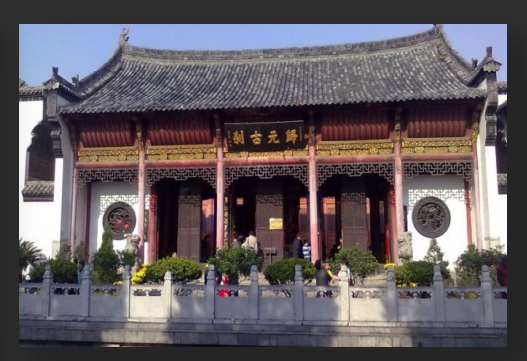
Guiyuan Temple 归元寺